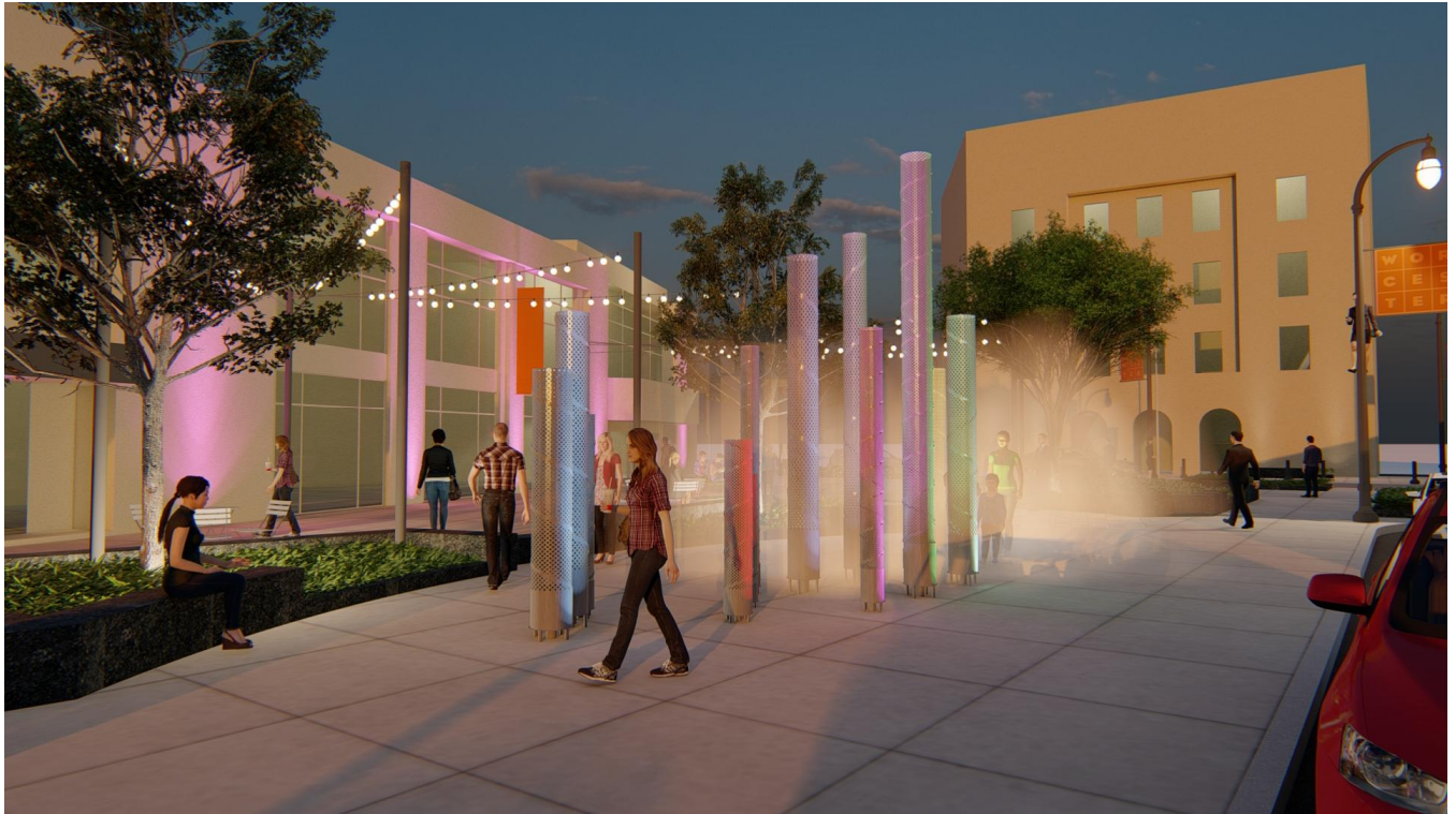
Carroll Plaza Sculpture – Night View

Reconstruction of Federal Square (Carroll Plaza) Worcester, MA Addendum No. 2 7/19/21